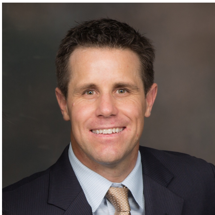
Dr Noeleen Heyzer